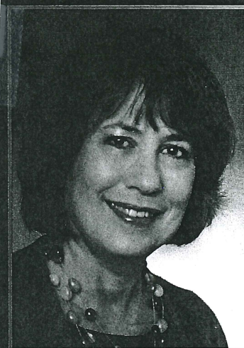
The Honorable Sheila C. Bair Former Chairman of the Federal Deposit Insurance Corporation

March 31 - April 1, 2014 New York City Waldorf Astoria Hotel